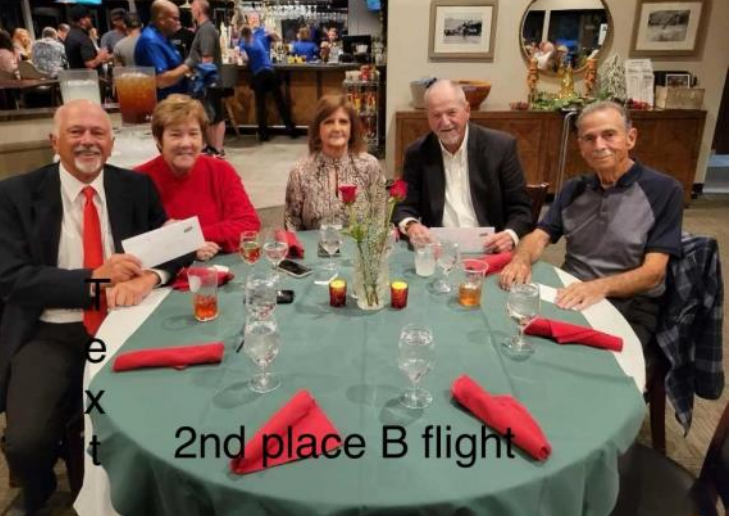
2nd place B flight