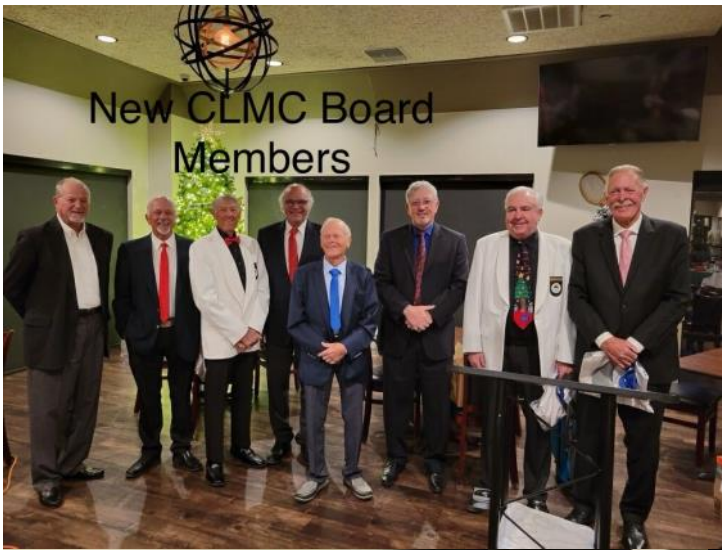
New CLMC Board Members