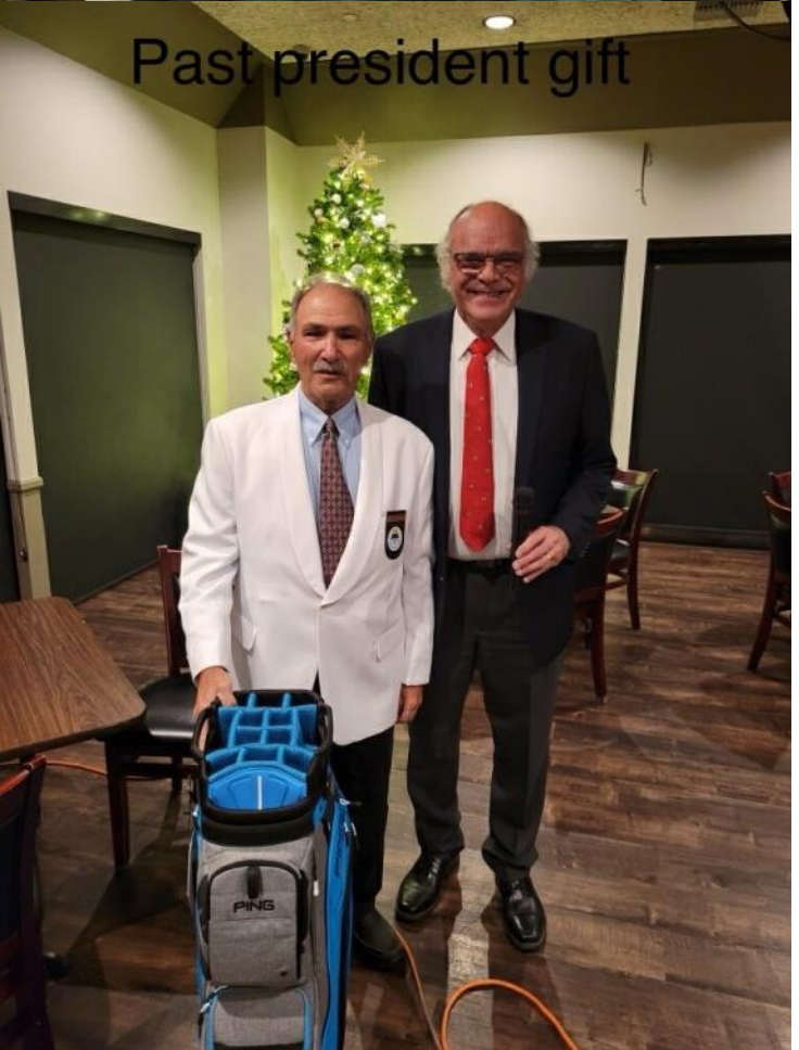
Past president gift