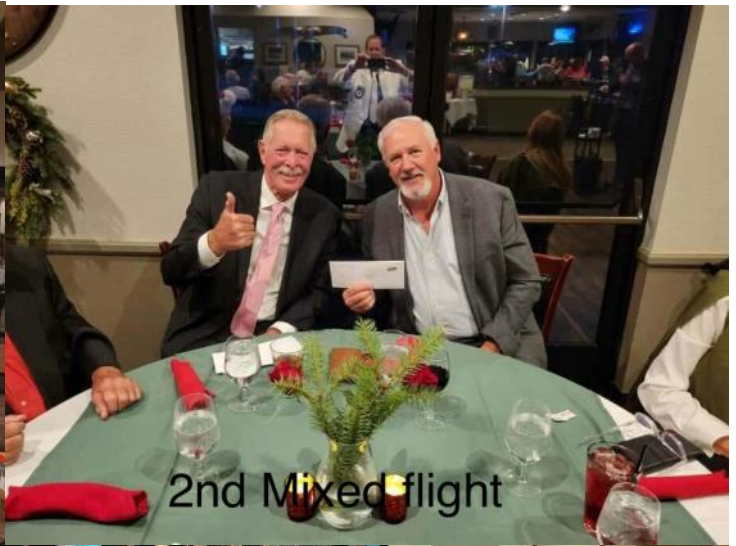
2nd Mixed flight