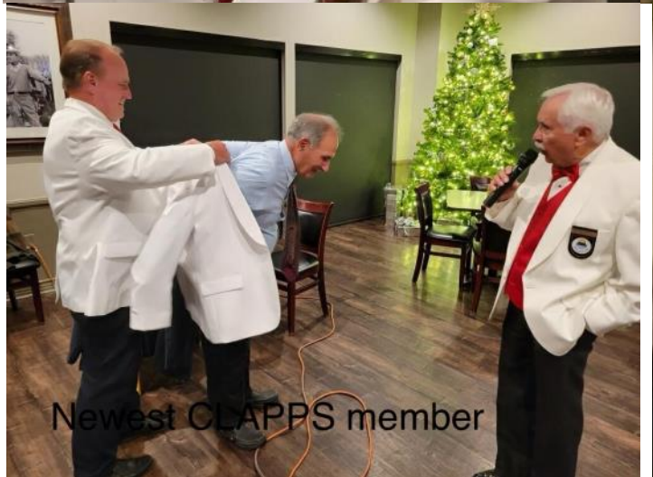
Newest CLAPPS member