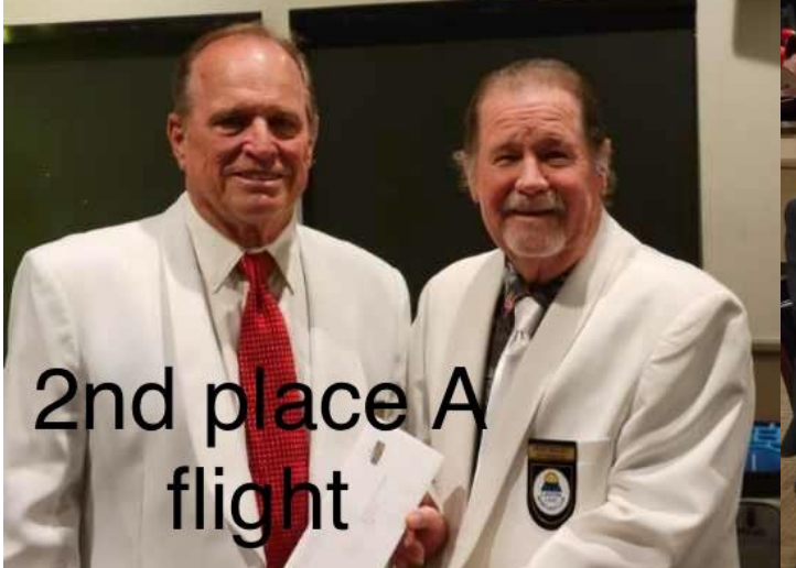
2nd place A flight