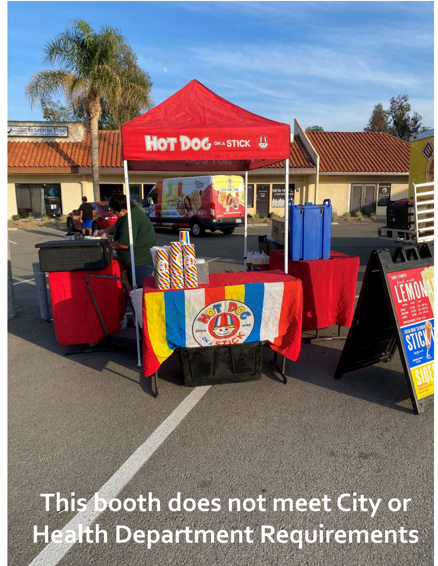
This booth does not meet City or Health Department Requirements